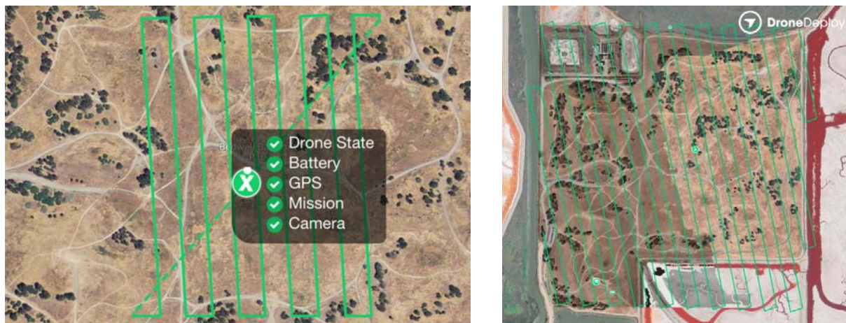
Fig. 2: Selection of the area to survey and of flight parameters (on the left), drone takeoff checklist (on the right) (DroneDeploy) drawn from: https://geosensornetworks.wordpress.com/2015/03/31/mobile-mapping-with-dronedeploy/ .

An interesting solution is represented by the software licensed by UgCS, a system that provides a platform for planning the flight via notebook enabling to manage complex flight plans and send them through app to the drone. It is also possible to choose a ready to fly UAV configuration, such as for example DJI Phantom 3, or to realize a customized one.